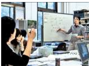
Discussion