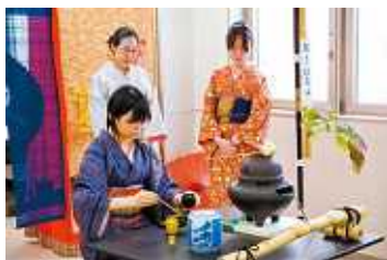
Tea Ceremony