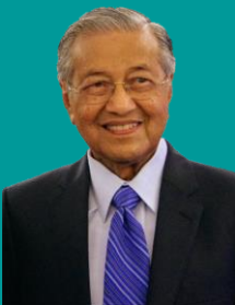
Tun Dr. Mahathir bin Mohamad