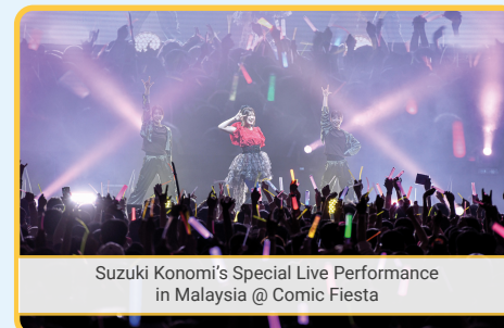
Suzuki Konomi's Special Live Performance in Malaysia @ Comic Fiesta