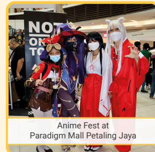
Anime Fest at Paradigm Mall Petaling Jaya