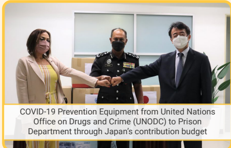
COVID-19 Prevention Equipment from United Nations Office on Drugs and Crime (UNODC) to Prison Department through Japan's contribution budget