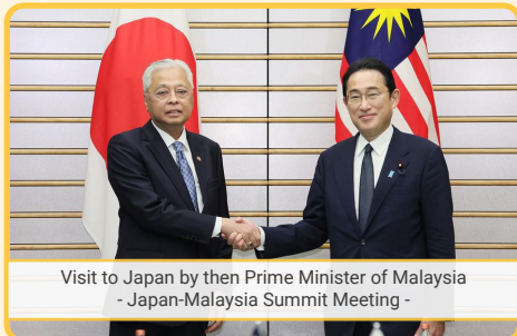
Visit to Japan by then Prime Minister of Malaysia - Japan-Malaysia Summit Meeting -