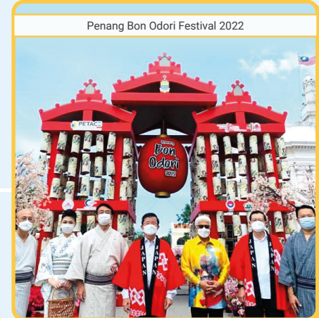
Penang Bon Odori Festival 2022