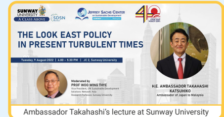
THE LOOK EAST POLICY IN PRESENT TURBULENT TIMES