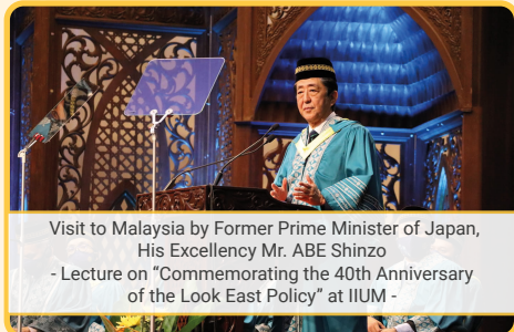
Visit to Malaysia by Former Prime Minister of Japan, His Excellency Mr. ABE Shinzo - Lecture on "Commemorating the 40th Anniversary of the Look East Policy" at IIUM -