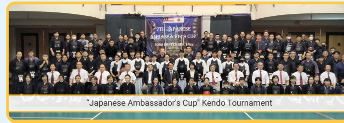
"Japanese Ambassador's Cup" Kendo Tournament