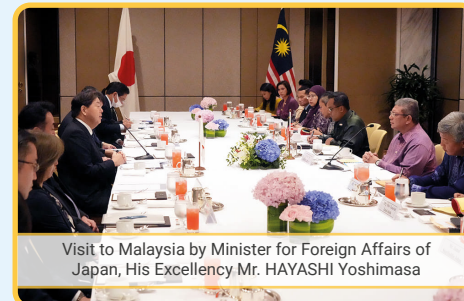
Visit to Malaysia by Minister for Foreign Affairs of Japan, His Excellency Mr. HAYASHI Yoshimasa