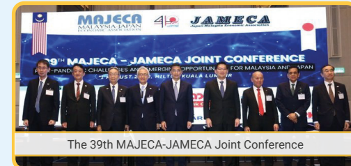
The 39th MAJECA-JAMECA Joint Conference