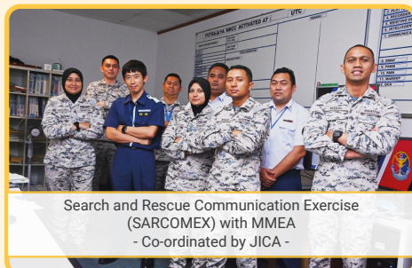
Search and Rescue Communication Exercise (SARCOMEX) with MMEA - Co-ordinated by JICA -