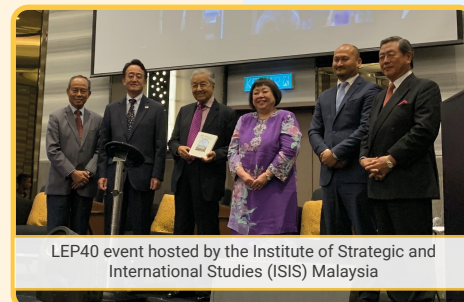
LEP40 event hosted by the Institute of Strategic and International Studies (ISIS) Malaysia