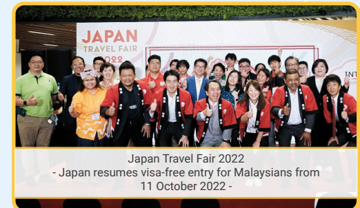
Japan Travel Fair 2022 - Japan resumes visa-free entry for Malaysians from 11 October 2022 -