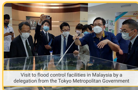
Visit to flood control facilities in Malaysia by a delegation from the Tokyo Metropolitan Government