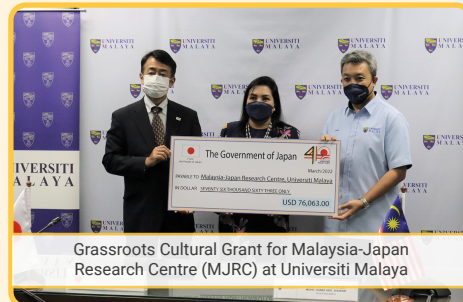
Grassroots Cultural Grant for Malaysia-Japan Research Centre (MJRC) at Universiti Malaysia