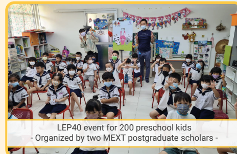
LEP40 event for 200 preschool kids - Organized by two MEXT postgraduate scholars -