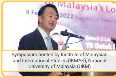
Symposium hosted by Institute of Malaysian and International Studies (IKMAS), National University of Malaysia (UKM)