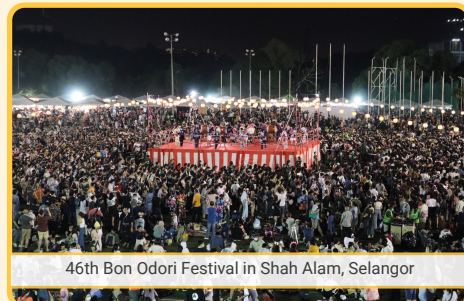
46th Bon Odori Festival in Shah Alam, Selangor