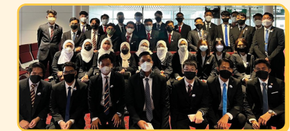
Look East Policy 40th batch students