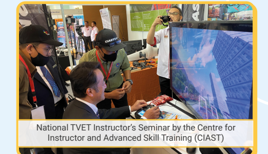
National TVET Instructor's Seminar by the Centre for Instructor and Advanced Skill Training (CIAT)