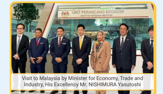
Visit to Malaysia by Minister for Economy, Trade and Industry, His Excellency Mr. NISHIMURA Yasutoshi