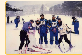
Japanese Government Scholarship recipients