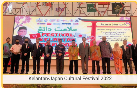
Kelantan-Japan Cultural Festival 2022