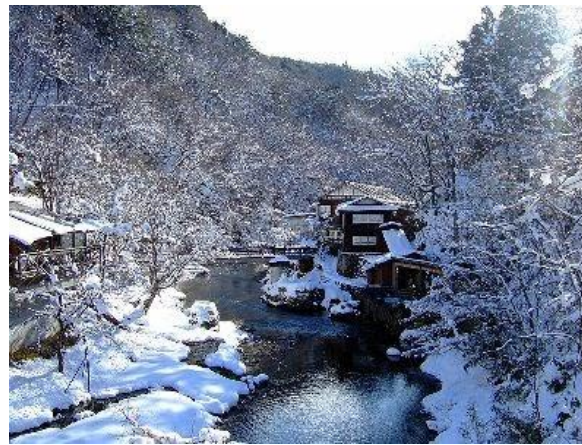
winter break (Dec - Jan)