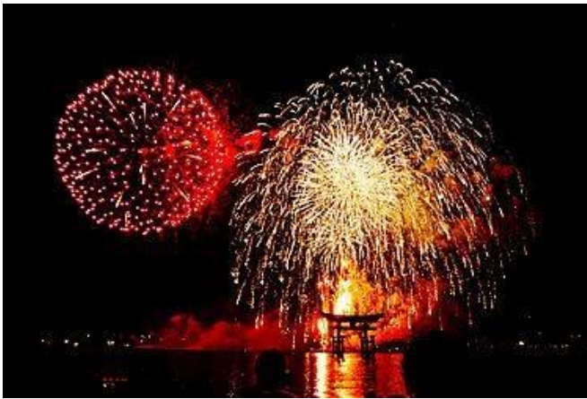
summer break (Aug - Sep)