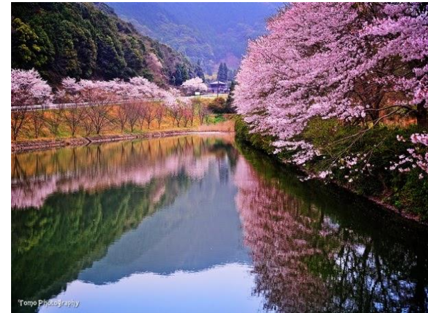
spring break (Feb - Mar)